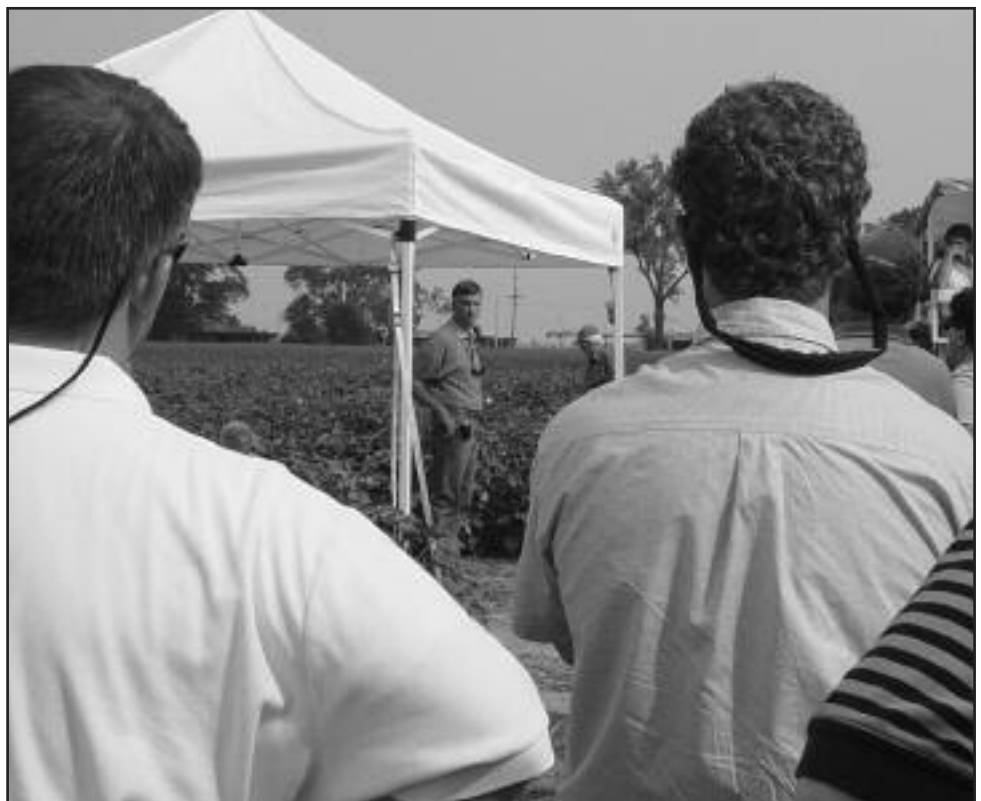
Farmers listen to a cotton presentation during the 10th annual Judd Hill Cotton Technology Field Day held on September 2 at the Judd Hill Plantation.

Examples cited for chair holder's research activity include molecular plant pathology and the study of mechanisms to improve disease resistance among plant varieties, plant stress physiology that will examine the development of plant varieties that tolerate certain specific conditions in various soil types, and plant-made pharmaceuticals and the study of genetically enhanced organisms by using plants as factories for the production of vaccines or other pharmaceutically active agents. □