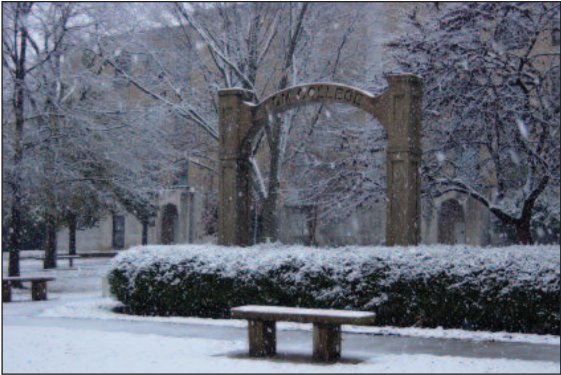
Winter on the ASU campus.