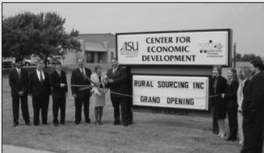
Rural Source-Community members cut a ceremonial ribbon at the opening of Arkansas Rural Sourcing, Inc., at Arkansas State University's Center for Economic Development.

Southern Arkansas University at Magnolia and the University of Arkansas-Monticello have joined Arkansas State University as active partners in education with ARS. □