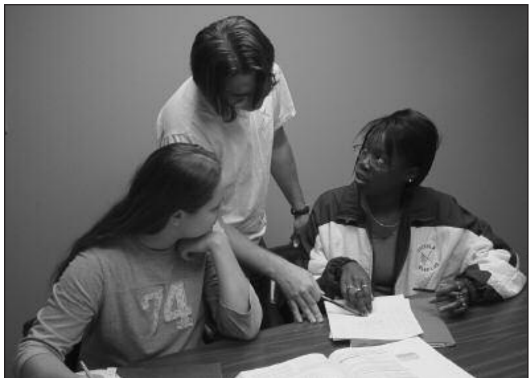
Student mentoring/tutoring is an important component of Upward Bound at Arkansas State University.