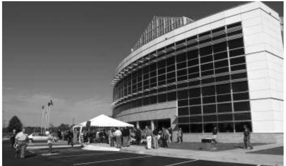
The Arkansas Biosciences Institute was built as a result of Initiated Act 1, passed by Arkansas voters in the 2000 general election, to impact the health of all Arkansans in a positive way.

“Research and higher education are long-term investments in making our lives better,” Attorney General Beebe said. “Research is also an important tool for economic development. Agricultural-based research falls in that category.”